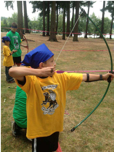
Learning skills at Cub Scout Day Camp