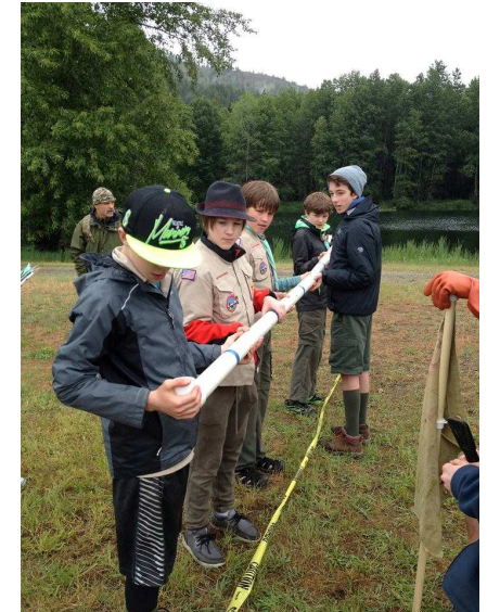
Teambuilding at Camporee