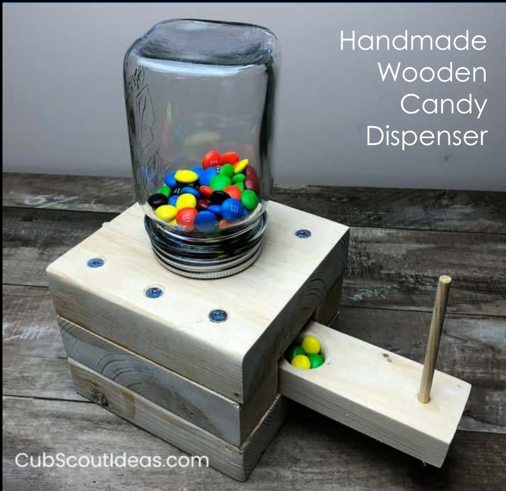
Handmade Wooden Candy Dispenser