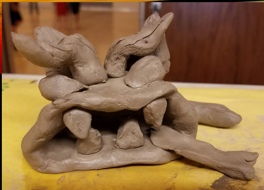
Clay Pinch Pot Monsters