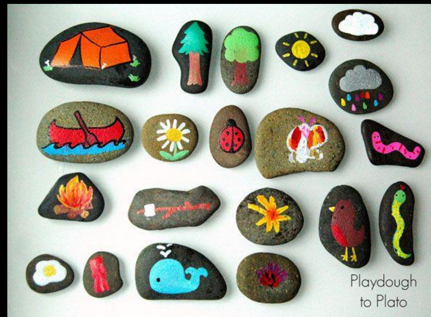
Painted Recruitment Rocks