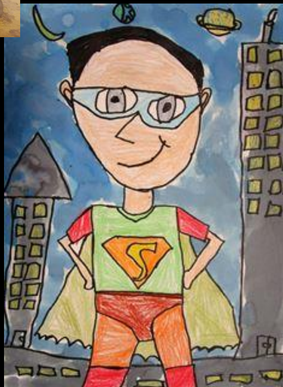
Super Hero Self-Portraits