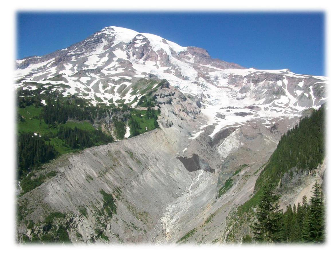
Nisqually Vista Loop (Mt. Rainier Nat. Park)