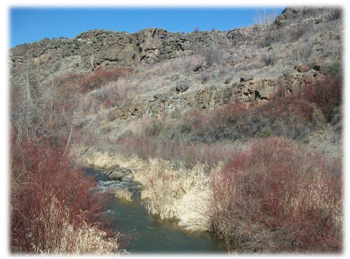
Cowiche Canyon (Yakima, WA)