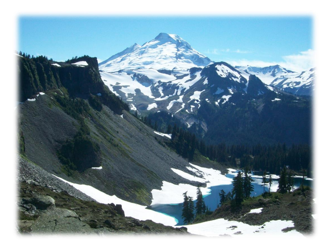
Chain Lakes Loop Mt. Baker National Park